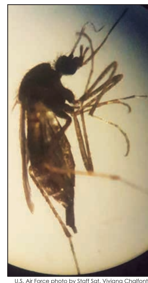
Mosquito being viewed underneath microscope during a public health surveil-

Permethrin. National Pesticide Information Center (2009, July). Retrieved from http://npic.orst.edu/factsheets/PermGen.