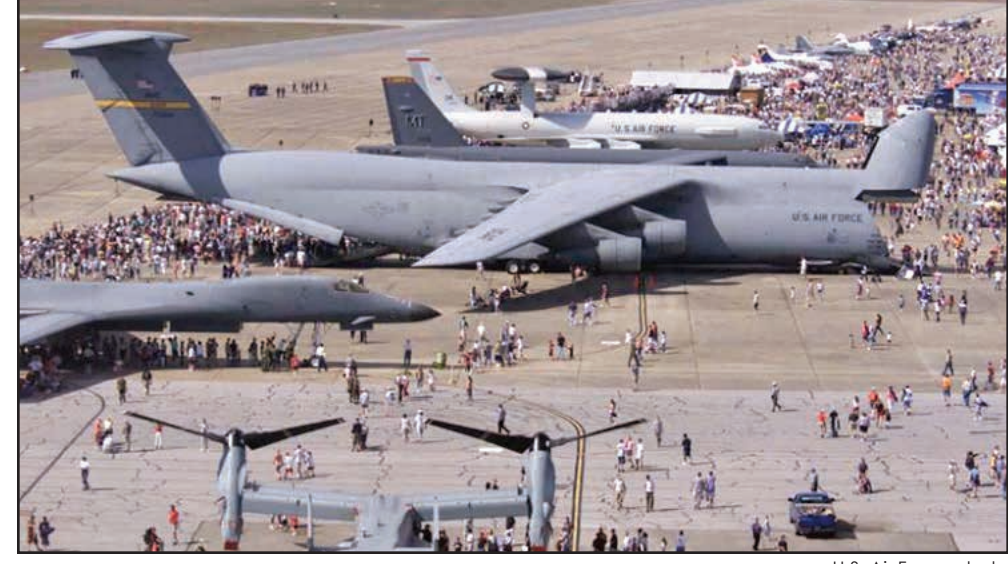
The largest airplane in the U.S. Military, the Air Force C-5 Galaxy dwarfs all other aircraft in this 2004 photo from Florida's Eglin Air Force Base.

A newly upgraded C-5M, the big bad belle of the ball, sat nearby, filling up the background, standing on its 28 wheels, holding its its rear cargo door to determine whether the